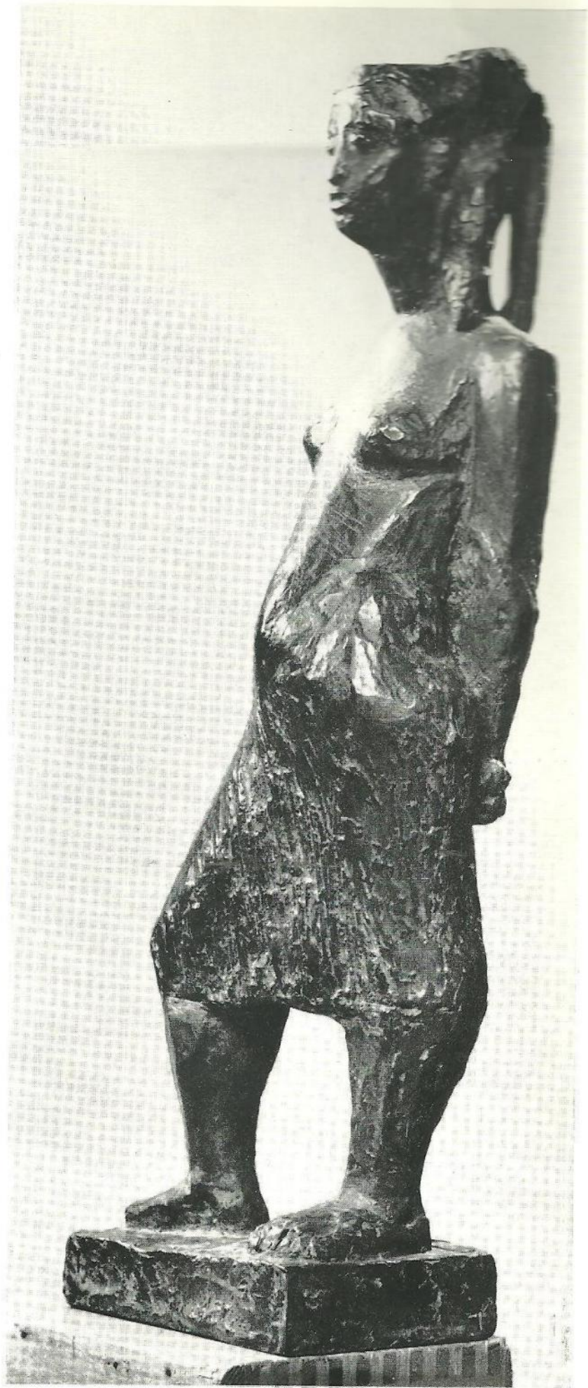
8. CAPRESE, bronze