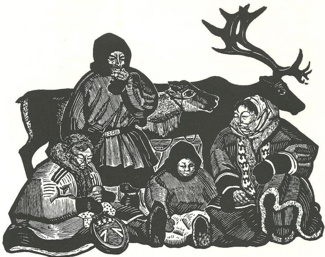
Morosov : A family in Buryat