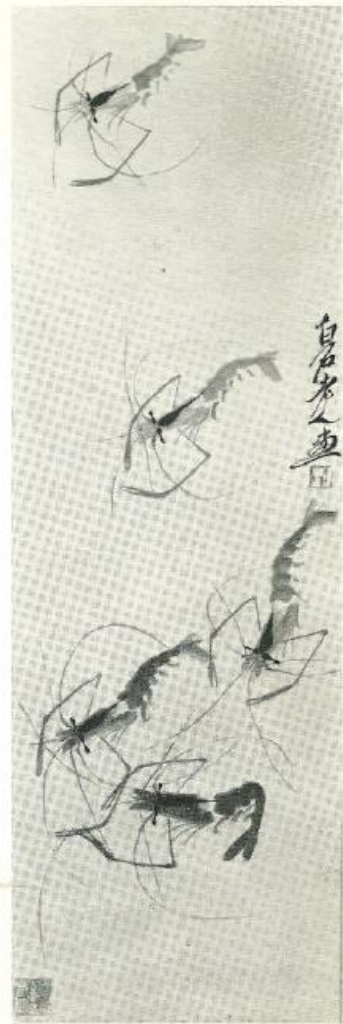
38 CH'I PAI-SHIH Shrimps

Next Exhibition 24 November ART IN THE EXECUTIVE SUITE