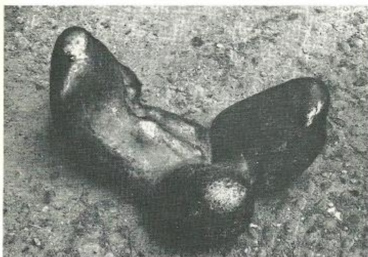
5 Torso of P.C. Bronze 1961