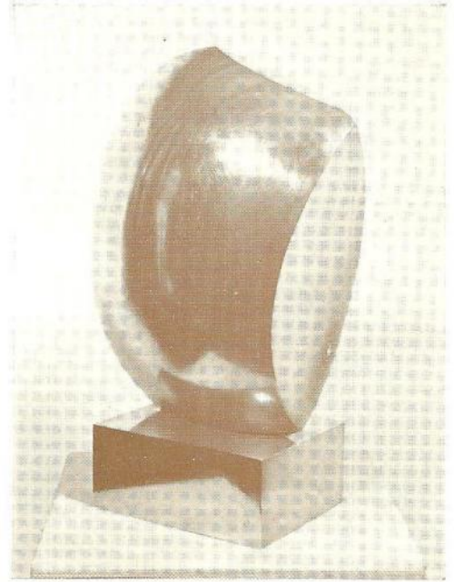
6 ARP Head