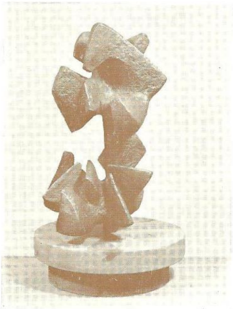
72 PENALBA Entincella