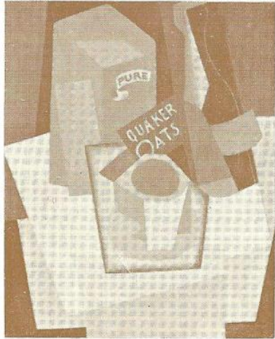
81 SEVERINI Quaker Oats