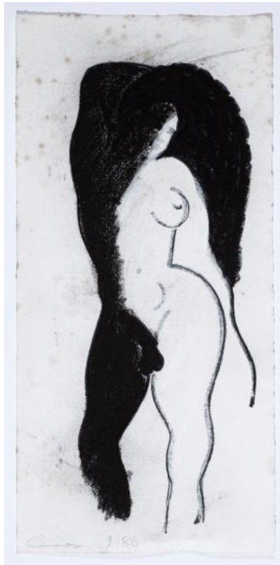
Nude , charcoal on paper