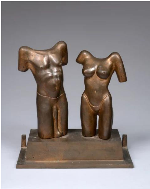
Shiva Parvati (1987), bronze