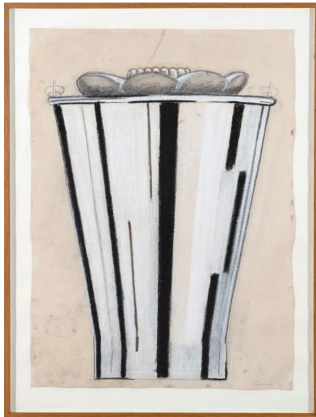
Gift II (1993), oil pastel on paper