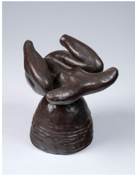
Diver II (1987), bronze