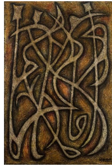
Syed Sadequain 1930-1987 Three Figures , 1967