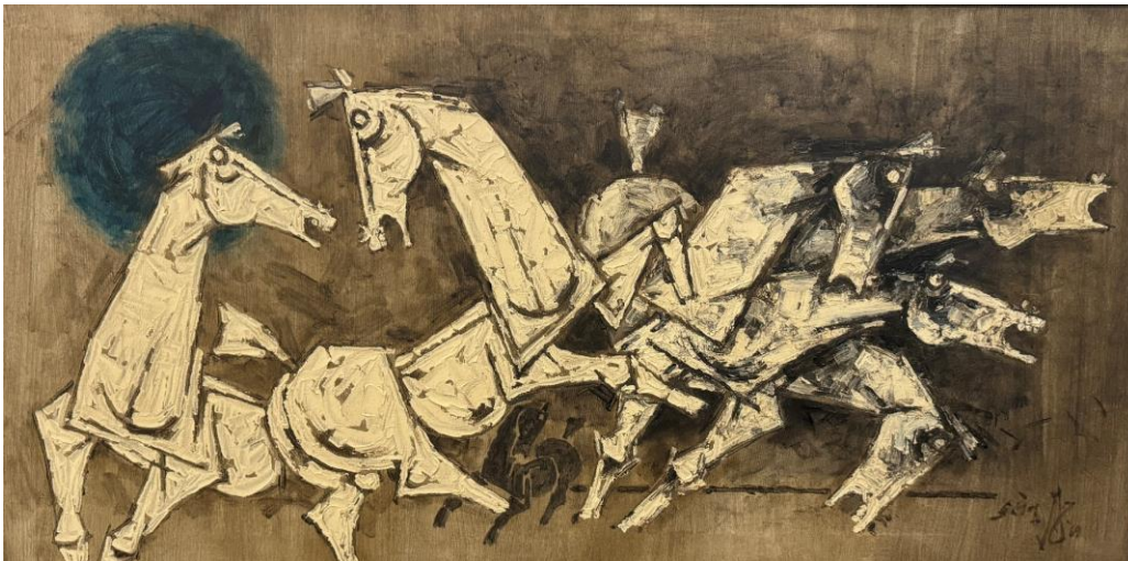
Maqbool Fida Husain 1915-2011 Horses and Blue Sun, 1969