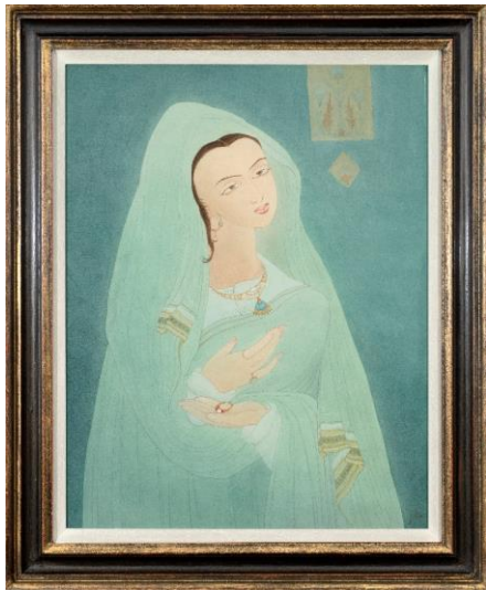
Abdur Rahman Chughtai 1897-1975 Untitled (Mughal Princess) , circa 1960

Syed Sadequain , another leading modernist from Pakistan, is known for his striking fusion of calligraphy and figuration. His inclusion in the 2024 Venice Biennale's Central Pavilion underscored his growing international recognition.