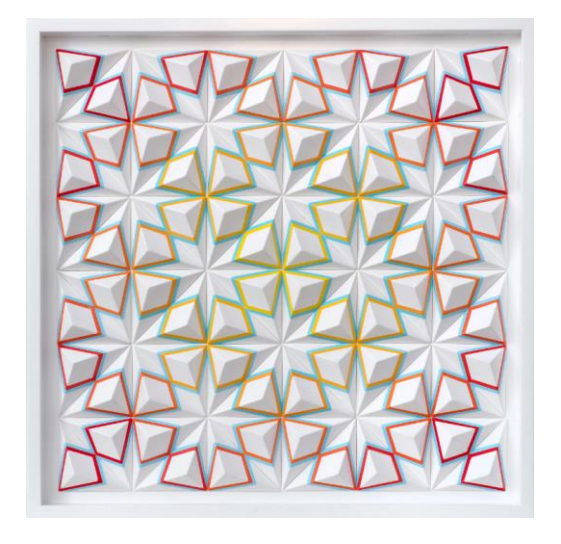
Root 2 (Yellow, Blue & Red), 2021

She is currently exhibiting as part of HARDPAPER, at Phoenix Art Space in Brighton, and from 3 April - 18 May her work will be shown at Coup de Ville 2024 in Sint Niklaas, Belgium.