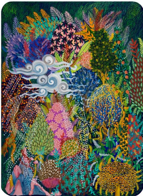
An Approximate Translation Of Self, 2022