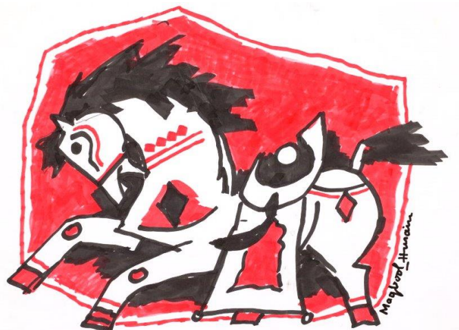
Maqbool Fida Husain Horse Watercolour on paper