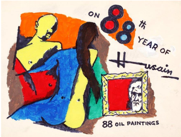
Maqbool Fida Husain Untitled (88 Oil Paintings), 2003 Watercolour on paper