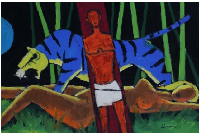
Maqbool Fida Husain Untitled, (Man, Woman and Tiger) Acrylic on canvas

M. F. Husain, Paintings and Drawings: Works from a Private Collection , opening and reception, coinciding with St James's late night opening, Grosvenor Gallery, 21 Ryder Street, SW1Y 6PX