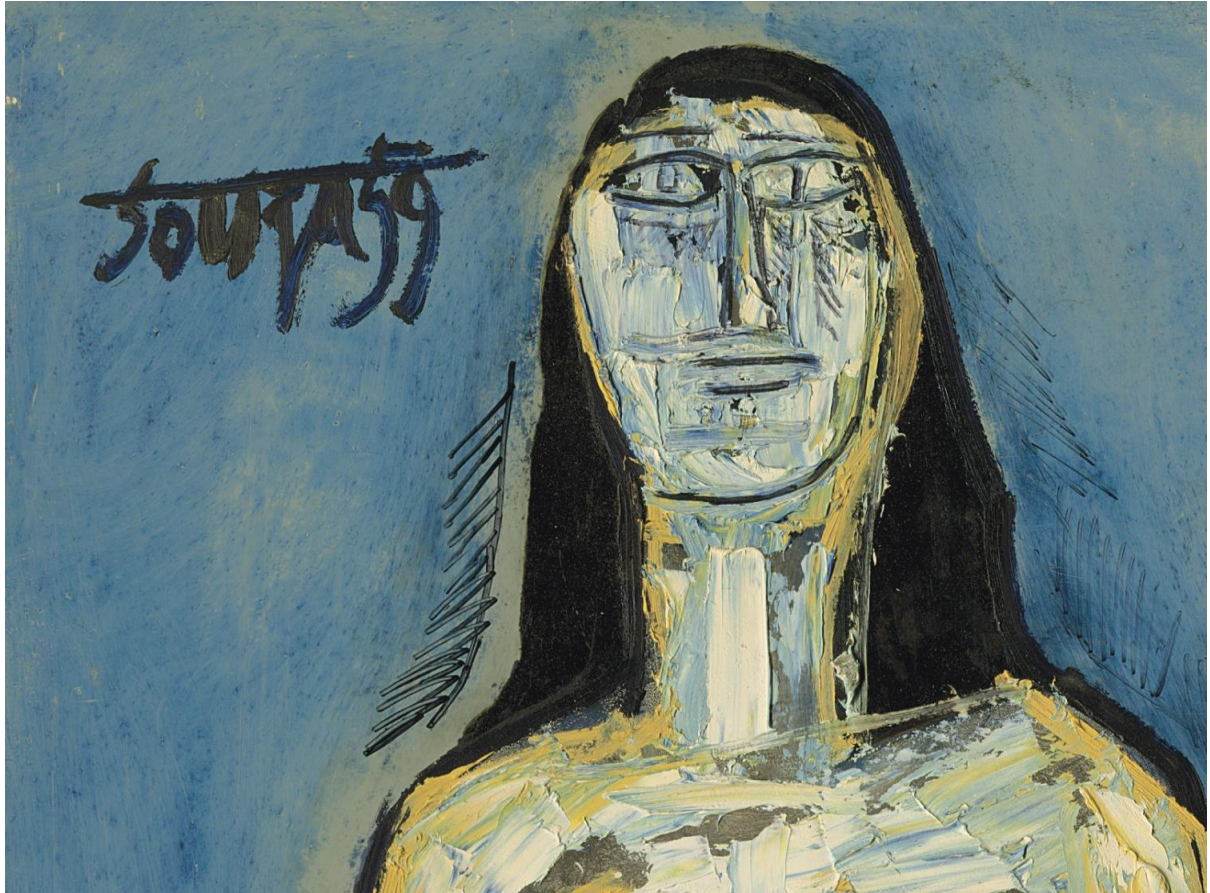
Francis Newton Souza, Standing Nude in City Background , 1959 (detail, above) Senaka Senanayake, Hummingbirds , 2018 (detail, below)