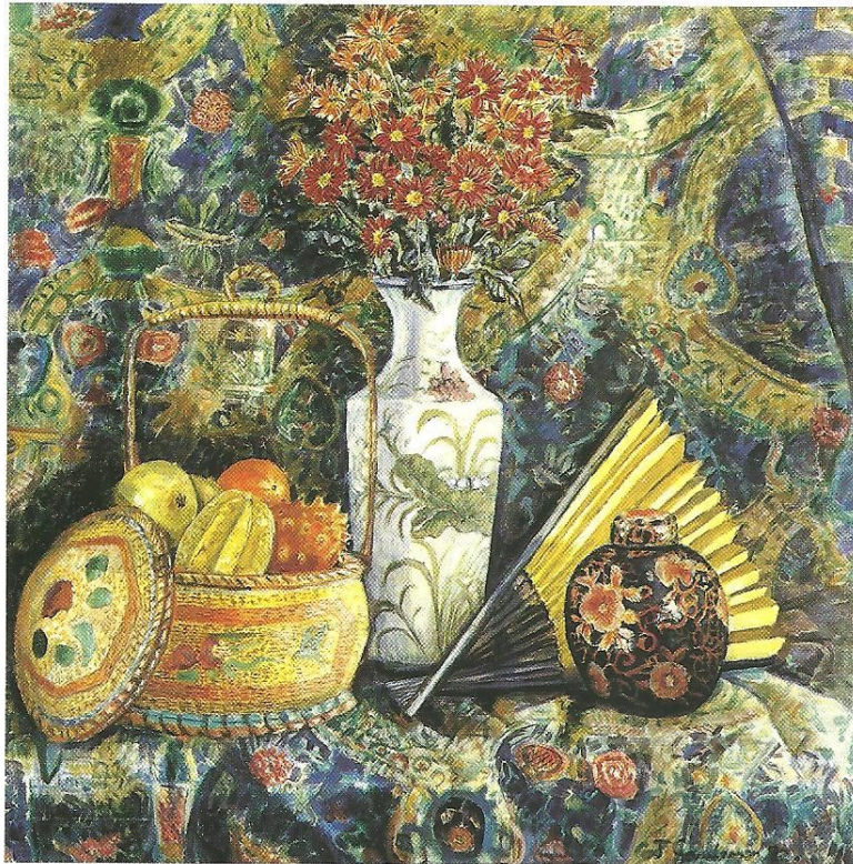
Still Life with Chrysanthemums