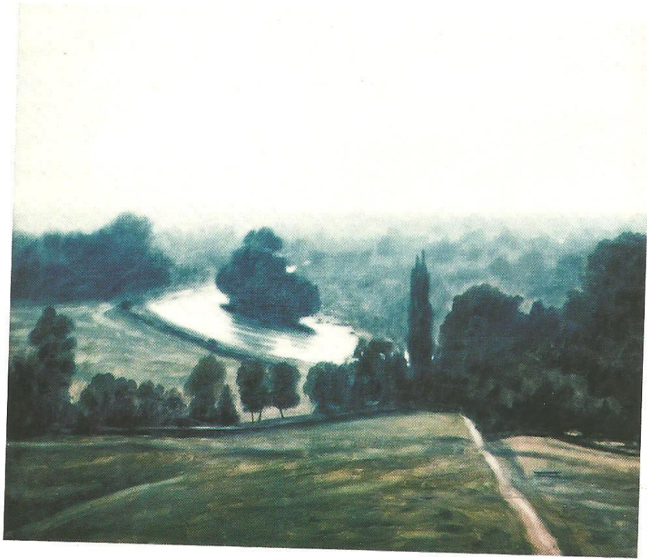
View from Richmond Hill