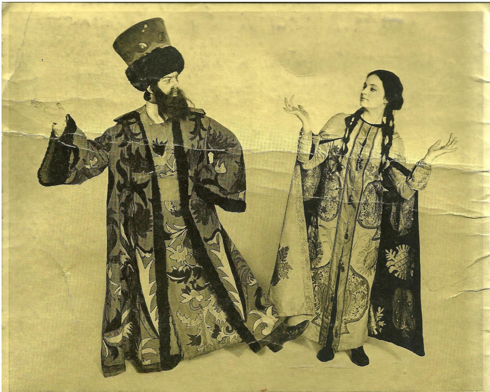
4 and 6 Original costumes for Le Coq D'or designed by Natalia Gontcharova