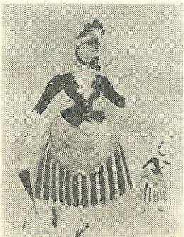
No. 45 56